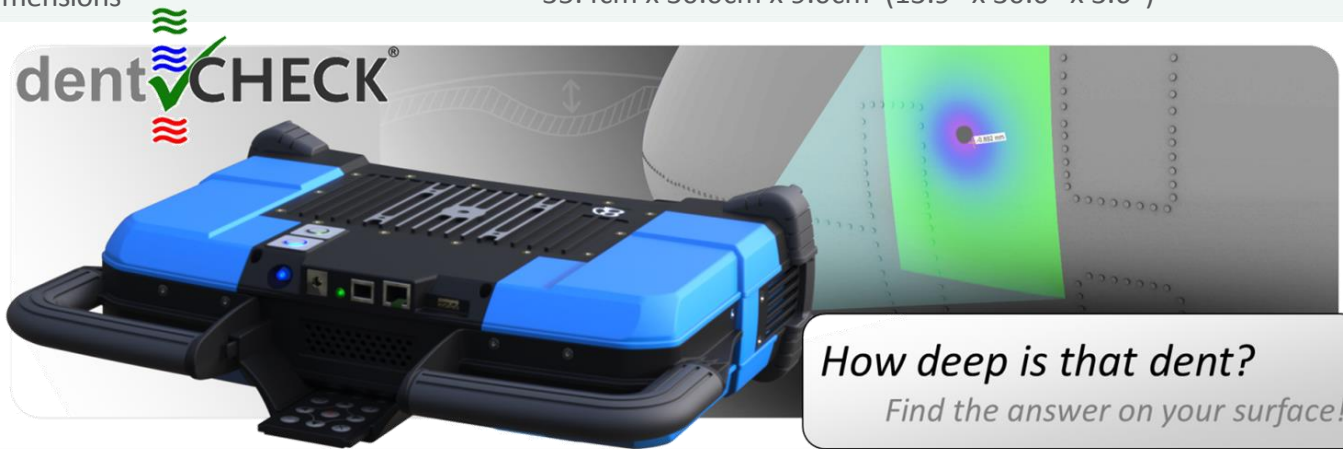
dentCHECK® optically measures the surface and marks-up a dent in less than two seconds